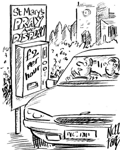
Yet another of the vicar's money-raising wheezes, I see